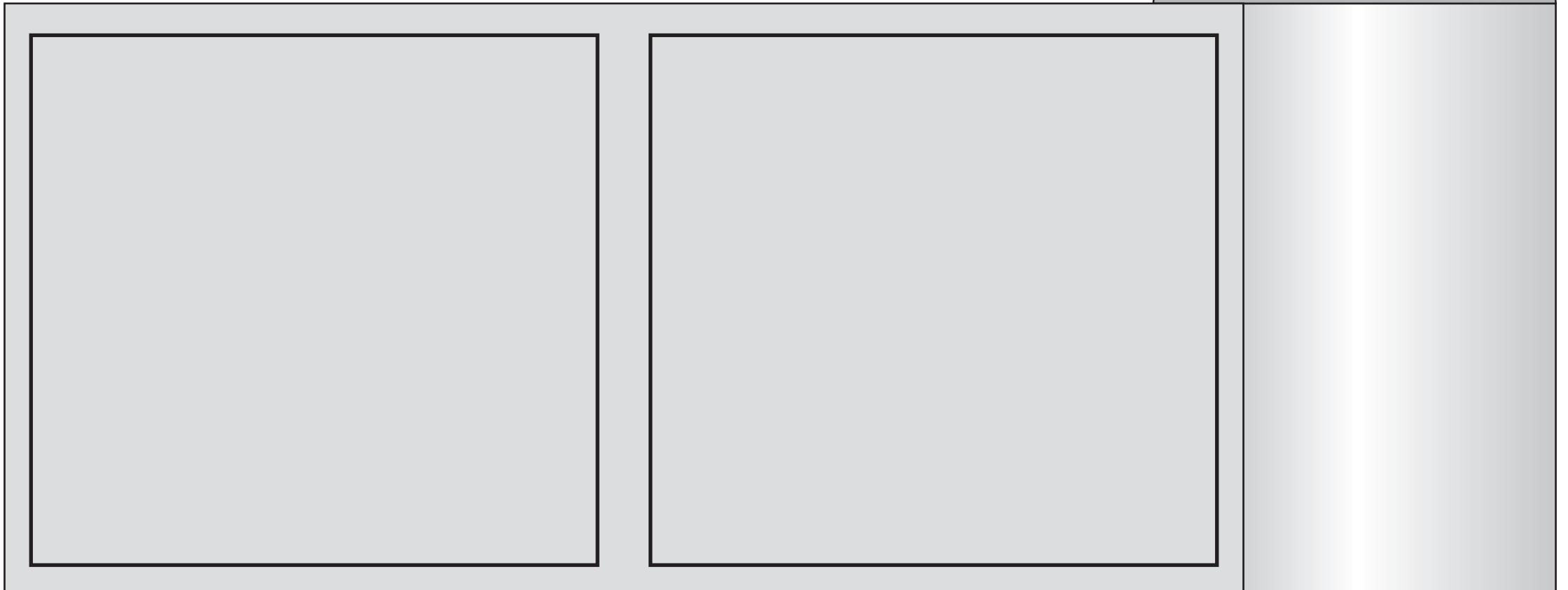
Printable areas on the bottom of the Bottle